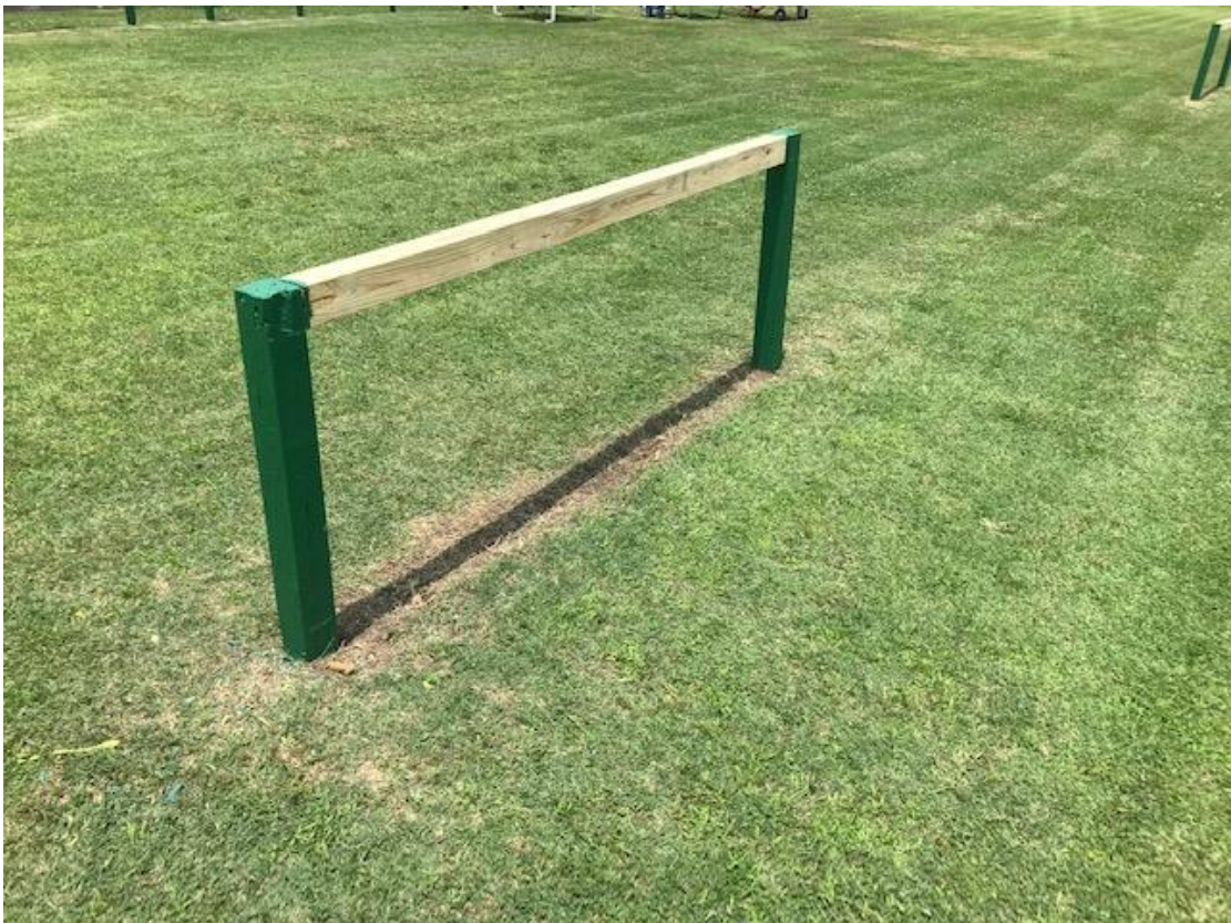
First step on the flight station rebuild.