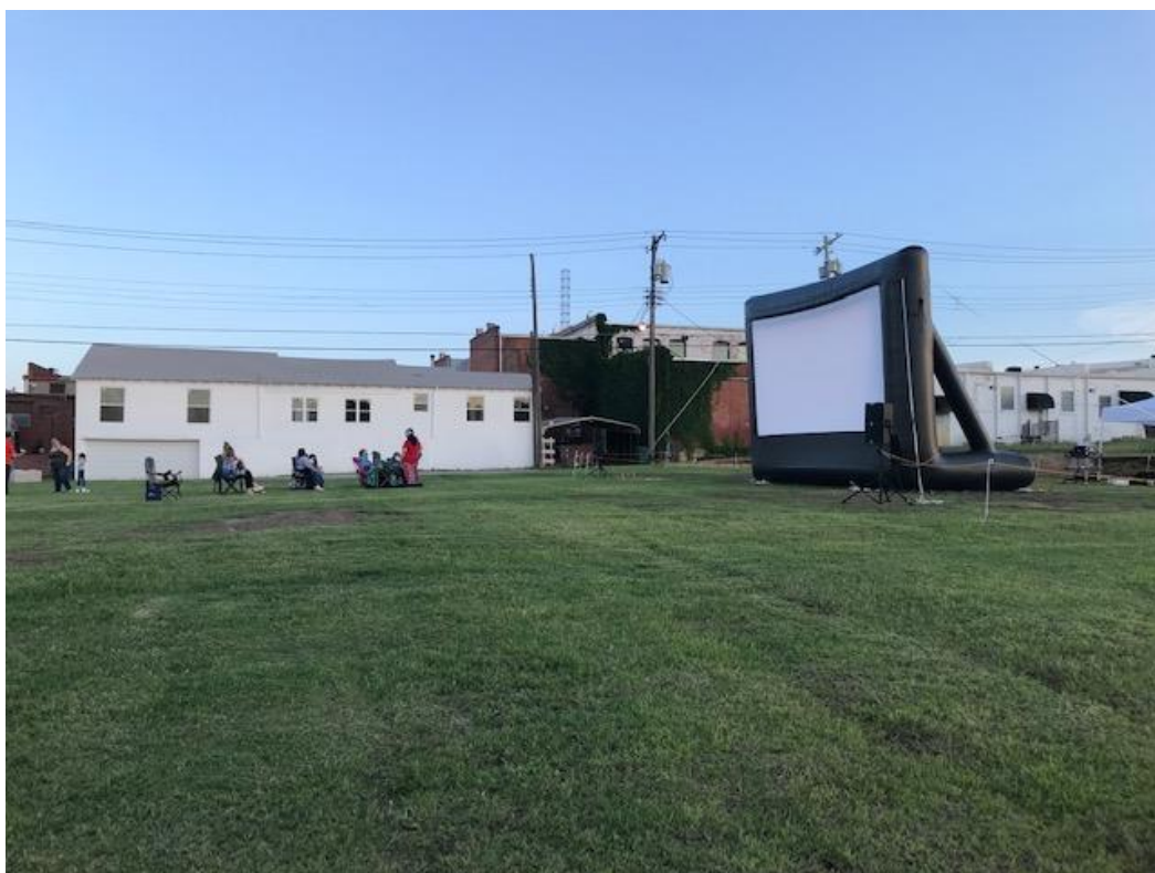
The big screen.