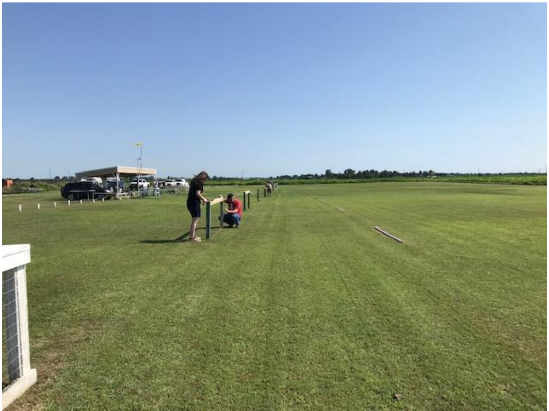
Putting some paint on the flight stations.