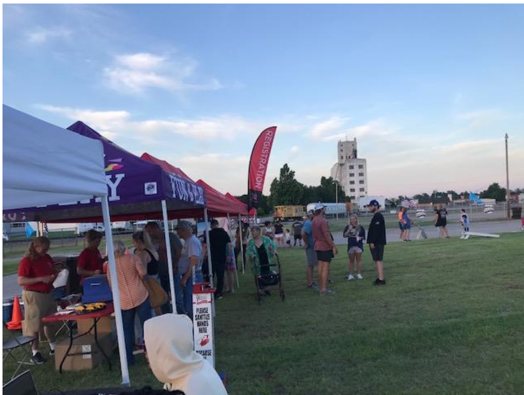
Other booths set up by the city.