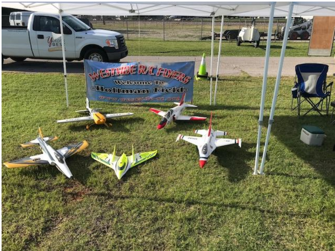
Aircraft on display.